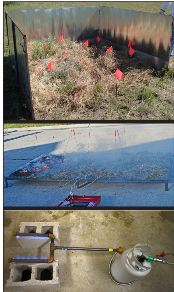
Figure 1. Images for each of the three experimental approaches conducted in Montana and North Dakota, USA, from 2012 to 2014. The top panel shows the burn box with one missing sheet to show the placement of the added biomass with in situ vegetation. The middle panel shows the burn table using plants rooted in pots and added timothy hay. The bottom panel shows the propane prong that was used inside an enclosed structure to burn plants rooted in pots.

standard propane tank. We formed the prong in a U shape with two 30 cm arms with holes every 6 mm (Figure 1). We burned five pots with paired plants for 60 sec between the prongs with a thermocouple 10 cm above the soil surface. We conducted all of our burns inside a closed structure with ventilation.